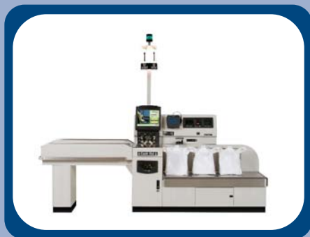
Full Size with Input Belt