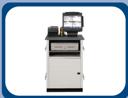
Compact Attendant Station