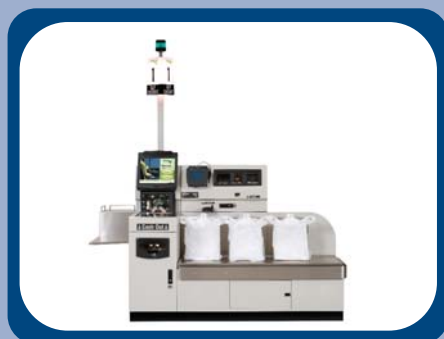
Full Size/3+ Bag