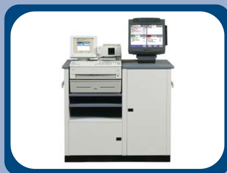
Full Size Attendant Station

NCR continually improves products as new technologies and components become available. NCR, therefore, reserves the right to change specifications without prior notice.