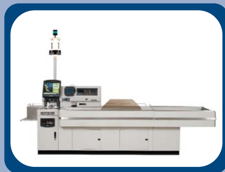
Take Away Belt